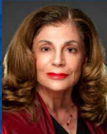
Shelley Berkley Mayor