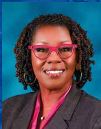
Shondra Summers-Armstrong Councilwoman Ward 5