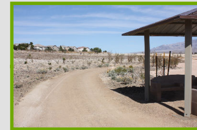
Floyd Lamb Park Trails