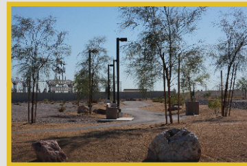
Angel Park Trail