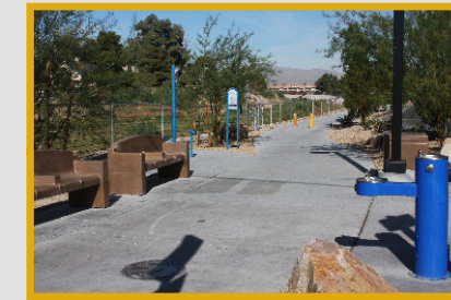
Las Vegas Wash Trail