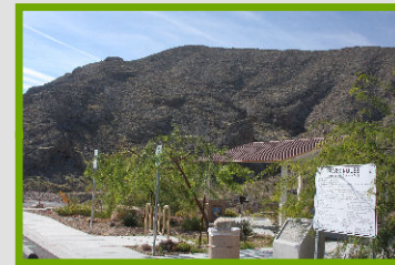
Gilmore/Cliff Shadows Trailhead