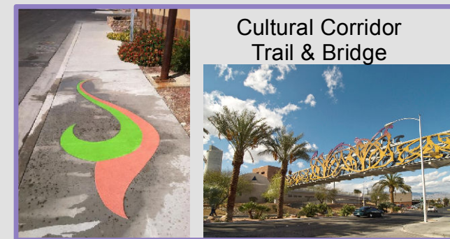
Cultural Corridor Trail & Bridge