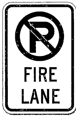
TYPE A SIGN

Signs shall be installed not less than 6 feet (1830 mm) and not more than 10 feet (3048 mm) from the ground level. Posts for signs shall be metal and securely mounted, unless written permission for alternatives is obtained prior to installation from the fire code official.