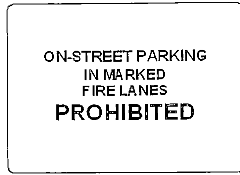
TYPE B SIGN