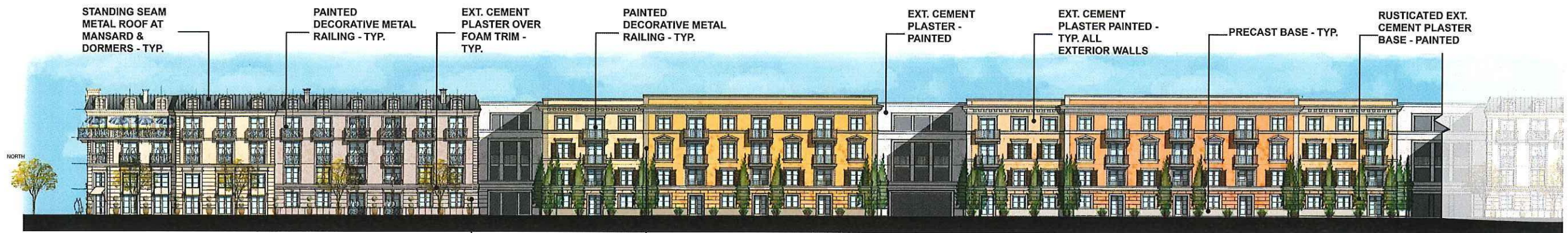
14 NORTH ELEVATION

STANDING SEAM METAL ROOF AT MANSARD & DORMERS - TYP.