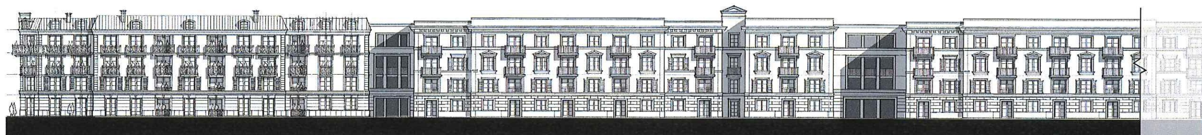
17 SOUTH ELEVATION